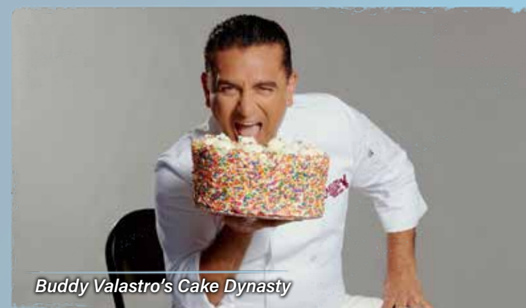
Buddy Valastro's Cake Dynasty