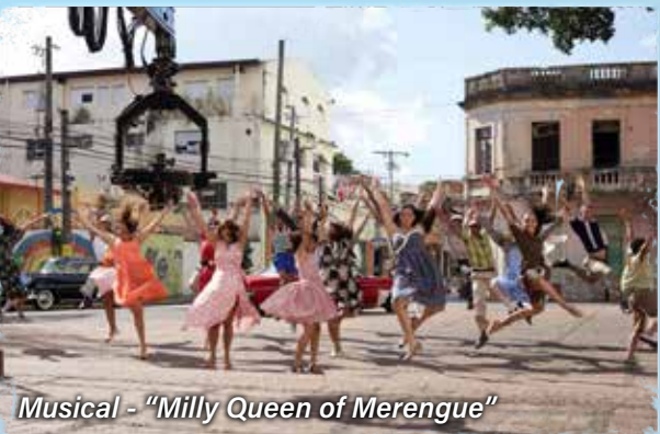
Musical - "Milly Queen of Merengue"