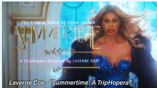
Laverne Cox - "Summertime: A TripHopera"

The American indie-pop duo Cafuné filmed their music video "Perspective" at the Cranford parking deck, American actress and LGBT advocate Laverne Cox filmed the music video "Summertime: A TripHopera" at a mansion in Tinton Falls, Kiss guitarist Ace Freely filmed a music video for his brand new song "10,000 Volts" at Wreck'd Studios in Tinton Falls, and finally tour visuals were filmed at Columbia High School in Maplewood for Newark native and Grammy Award winner Lauryn Hill .