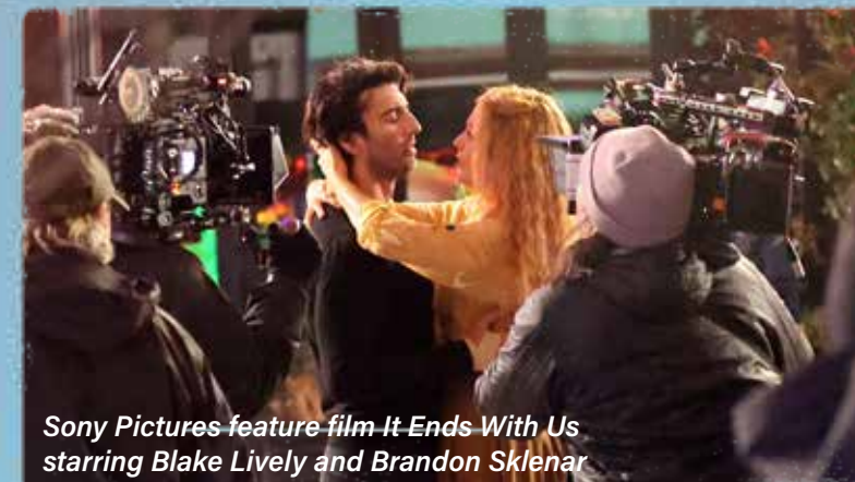
Sony Pictures feature film It Ends With Us starring Blake Lively and Brandon Sklenar