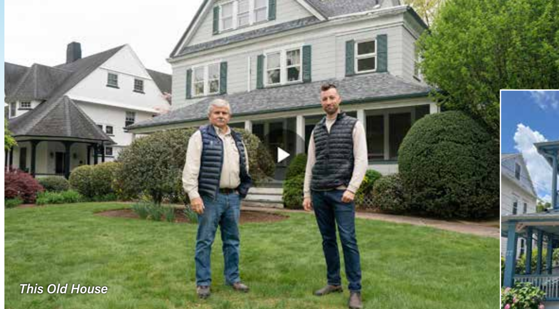
This Old House