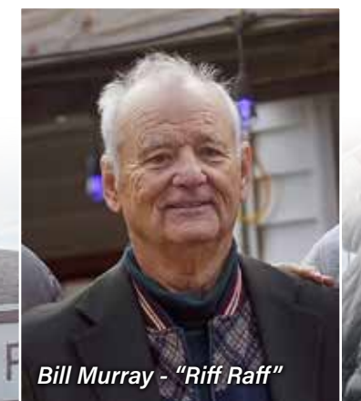
Bill Murray - "Riff Raff"