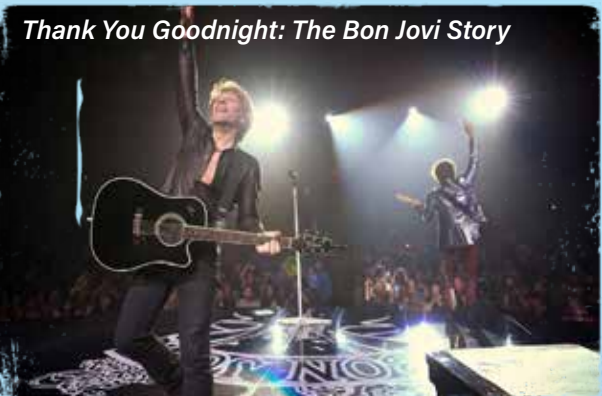
Thank You Goodnight: The Bon Jovi Story