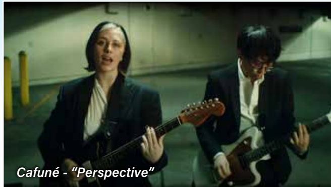
Cafuné - "Perspective"