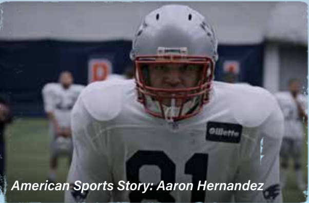
American Sports Story: Aaron Hernandez

The list of New Jersey success stories is growing longer every year and showcases the state as fertile ground for the imagination industry, and a great place to live and work.