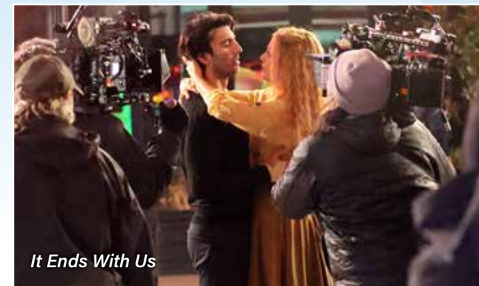
It Ends With Us

Based on the popular novel by Colleen Hoover, the feature film It Ends with Us stars Blake Lively, Brandon Sklenar and Justin Baldoni, and was directed by Justin Baldoni. The movie was shot in Plainfield, Weehawken, Newark, Harding Township, Chatham, Parsippany-Troy Hills, Hoboken and Jersey City.