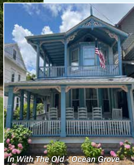
In With The Old - Ocean Grove

Some New Jersey homes and buildings have interesting stories, and several programs are ready to bring those stories into the spotlight. In with the Old , now in its fifth season, focuses on renovating historical homes across the country, and in the Garden State production set their sights on a 140-year-old Victorian cottage in Ocean Grove; This Old House kicked off its remarkable 45th season in Glen Ridge to remodel an 1887 Victorian-style home; the long running and ever-popular House Hunters filmed in Fairfield, Chester and Wildwood; and finally Mysteries of the Abandoned ,