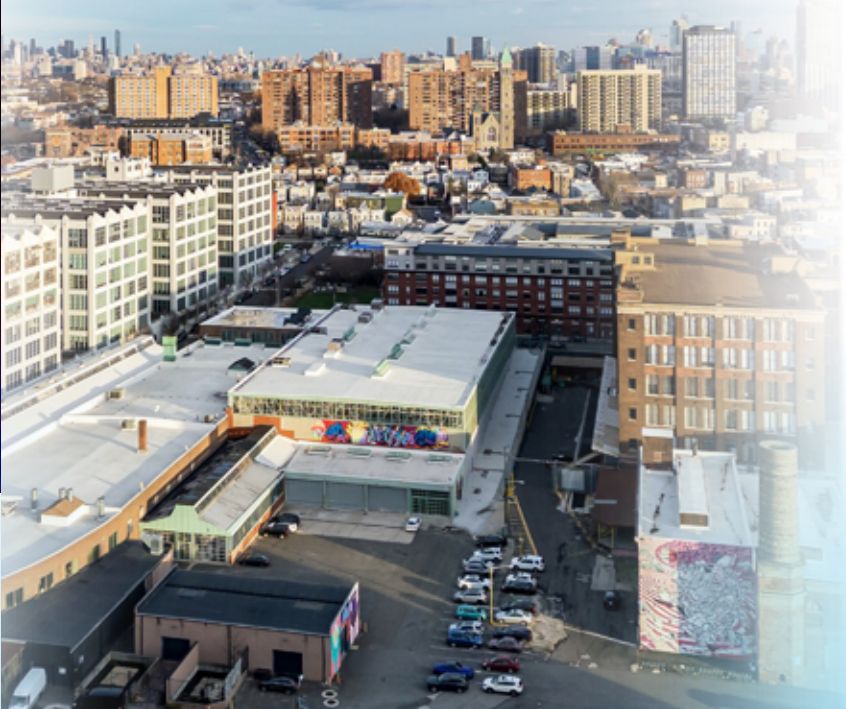
Parlay Studios in Jersey City