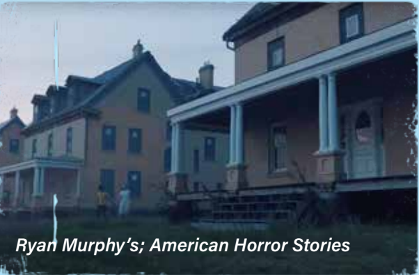
Ryan Murphy's; American Horror Stories