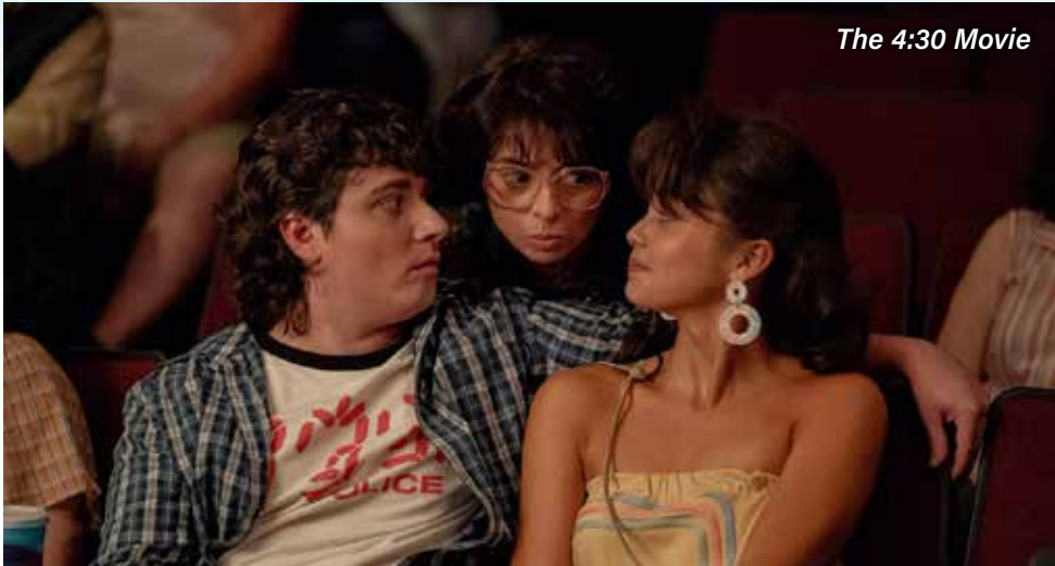
The 4:30 Movie