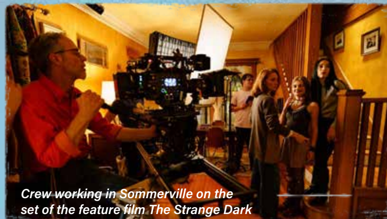
Crew working in Sommerville on the set of the feature film The Strange Dark