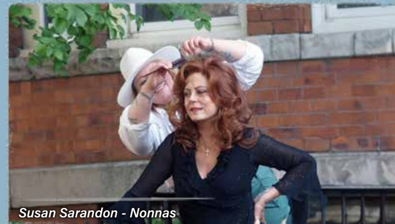
Susan Sarandon - Nonnas