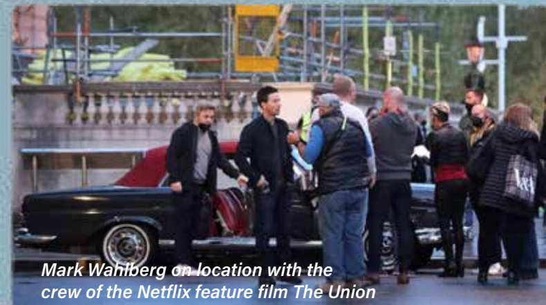
Mark Wahlberg on location with the crew of the Netflix feature film The Union