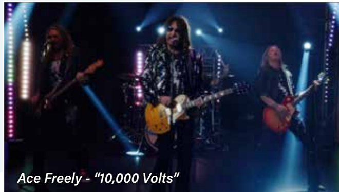
Ace Freely - "10,000 Volts"