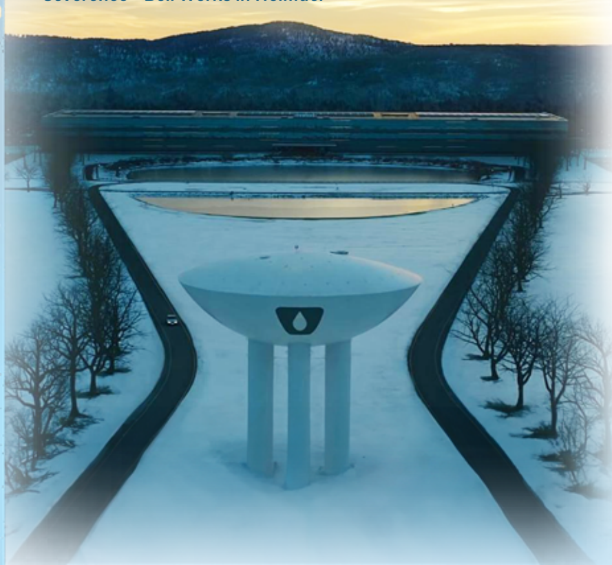
Severance - Bell Works in Holmdel

The series FBI: Most Wanted returned to New Jersey to film its 4th season. The show, which follows a crack division of FBI agents tasked with tracking and capturing notorious criminals on the FBI's Most Wanted List, stars Alexa Dalvalos, Dylan McDermott and Julian McMahon, was created by Rene Balcer, and is executive produced by Dick Wolf. Filming took place in Parsippany, Montclair, Little Falls, Bloomingdale, and Alpine.