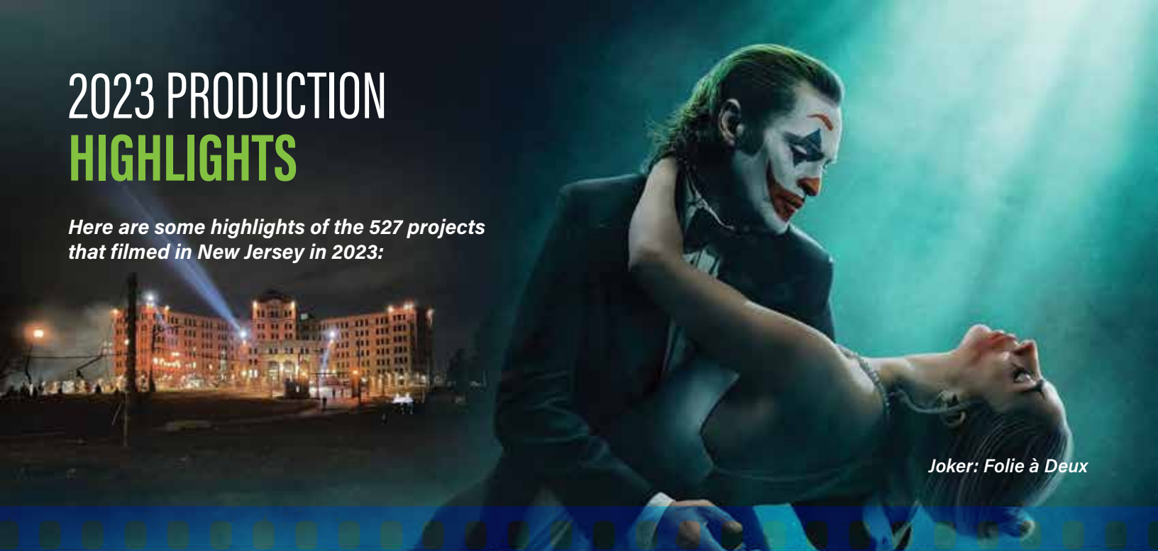
Joker: Folie à Deux

Here are some highlights of the 527 projects that filmed in New Jersey in 2023: