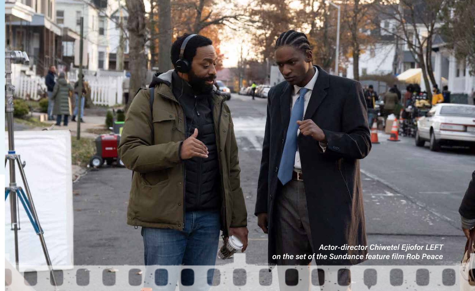
Actor-director Chiwetel Ejiofor LEFT on the set of the Sundance feature film Rob Peace

"New Jersey's production industry is prospering and growing, and the Garden State remains poised for greater future success."