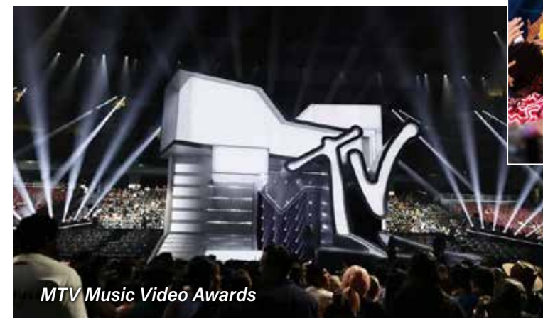
MTV Music Video Awards