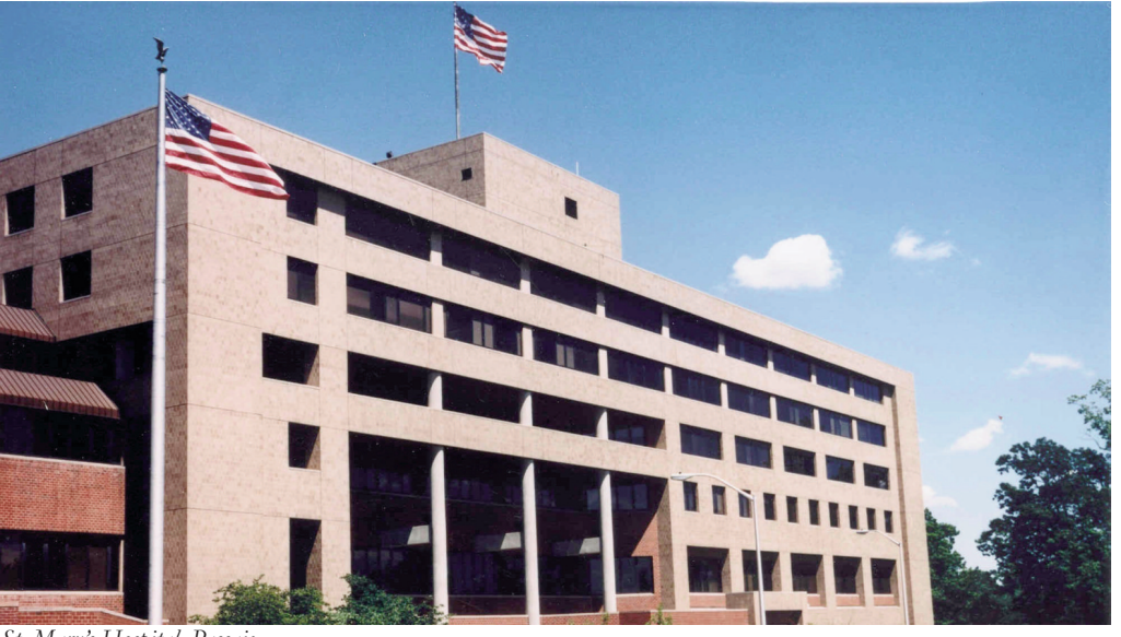
St. Mary's Hospital, Passaic