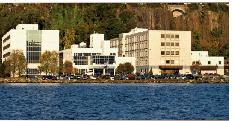
Palisades Medical Center

In response to the requirements outlined in the New Jersey Medical and Health Sciences Education Restructuring Act signed into law on August 22, 2012 – which dissolved the University of Medicine and Dentistry of New Jersey (UMDNJ) and created a stand-alone University Hospital – the Authority undertook a private placement of approximately $150 million of Revenue Bond Anticipation Notes on behalf of University Hospital.