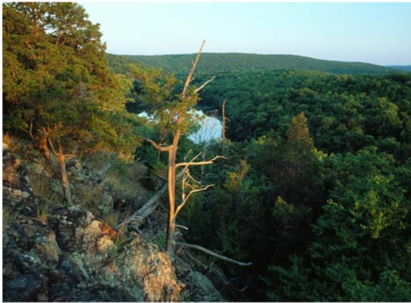
Sparta Mountains, NJ Highlands

The Council is committed to developing a Regional Master Plan that is as comprehensive, scientifically robust, and as transparent as possible. The Council believes that the plan, when complete, will be a living document which will provide guidelines for development and resource protection, based on the best available science and data and will incorporate the input from scientists, planners, community