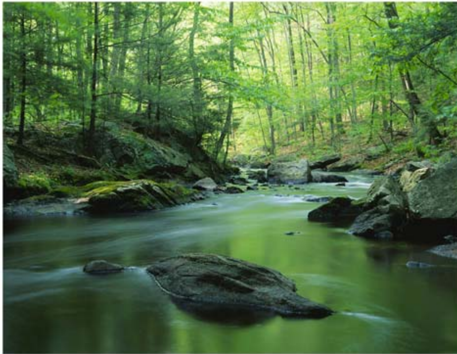
Black River, New Jersey Highlands, Morris County, NJ

“The Highlands watersheds are the best in the State in respect to ease of collection, in scantiness of population, with consequent absence of contamination; in elevation, giving opportunity for gravity delivery and in softness as shown by chemical analysis. These watersheds should be preserved from pollution at all hazards, for upon them the most populous portions of the State must depend for water supplies. There has been too much laxness in the past regarding this important matter.” 1907 Potable Water Commission Report.