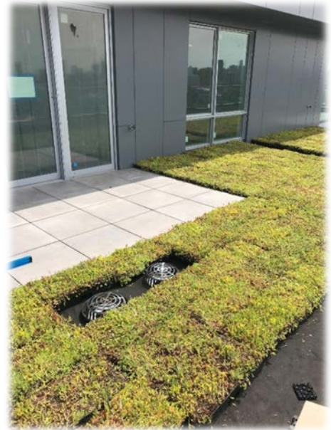
Jersey City, NJ