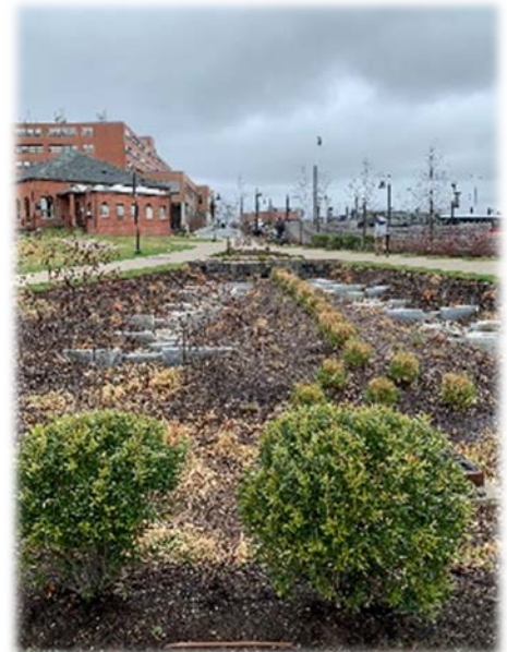
Providence College, RI