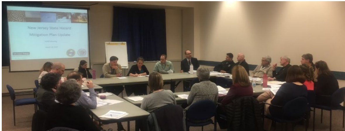
Figure 2-1 Round Table Discussion with NJDEP

The State HMP Plan Update consisted of more than 160 participants who were invited to participate in the planning process. Refer to Table 2-3 which outlines the membership and roles of the plan participants. All planning partners were invited to and convened at planning meetings, participated in conference calls, met with the planning consultant, and provided comments throughout the Plan update process. Communication was conducted through email and a secure SharePoint project site where documents and planning templates were posted for review by plan participants and NJOEM Mitigation Unit staff. The planning consultant established this dedicated SharePoint website for efficient communication and document dissemination (refer to Figure 2-2 below). Some documents were not intended to be public, so access was restricted via user name and password.