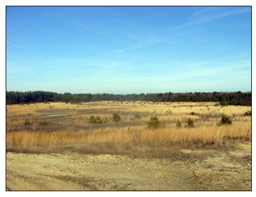
In 2014, the Commission permanently preserved a 195-acre property (above) in Jackson, Manchester and Toms River townships.

The property features exceptional natural resources, including 1,500 linear feet of