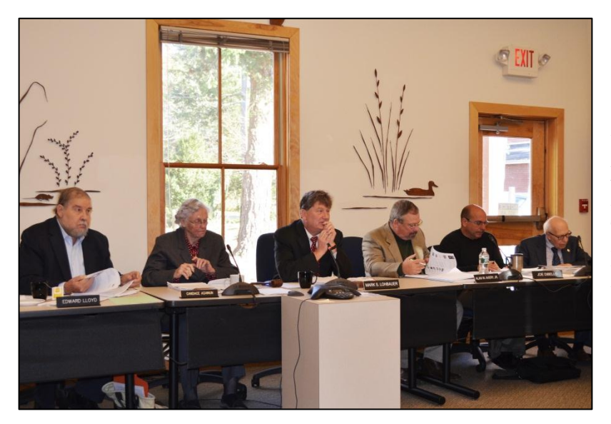
The Commission adopted several amendments to the Pinelands Comprehensive Management Plan in 2014.

More specifically, the amendments serve to codify current Commission practice, clarify existing standards and requirements, increase the efficiency of the Commission and its staff, eliminate unnecessary application requirements and correct typographical errors in the regulations. The