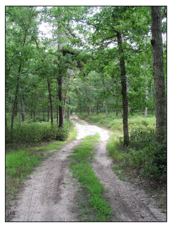
Stockton College deed-restricted more than 1,200 acres of high-integrity habitat as part of its 2010 Master Plan, including the property above.

The College's 2010 Master Plan identifies oncampus development projects during the course of the next 20 years, based on projected student enrollment. The College's potential development projects include nearly 2.4 million square feet of new development, nearly 11,000 new parking spaces and more than 3,100 new dwelling units, most of which are dormitories. All of these projects are delineated on Designated Development Areas. The Commission has reviewed these areas and it has determined that the areas do not involve any