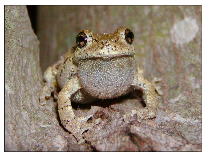
Some stormwater basins can provide breeding habitat for the endangered southern gray treefrog.

Like natural wetlands, created wetlands can provide the habitat necessary for wetland-dependent plants and animals, especially in human-dominated landscapes where natural wetlands may have been degraded or eliminated. As part of another study, Commission scientists mapped the location of two types of created wetlands commonly found in the Pinelands, shallow excavations that intercept the groundwater (excavated ponds) and excavations designed to receive stormwater (stormwater basins). About 2,000 excavated ponds and 1,700 stormwater