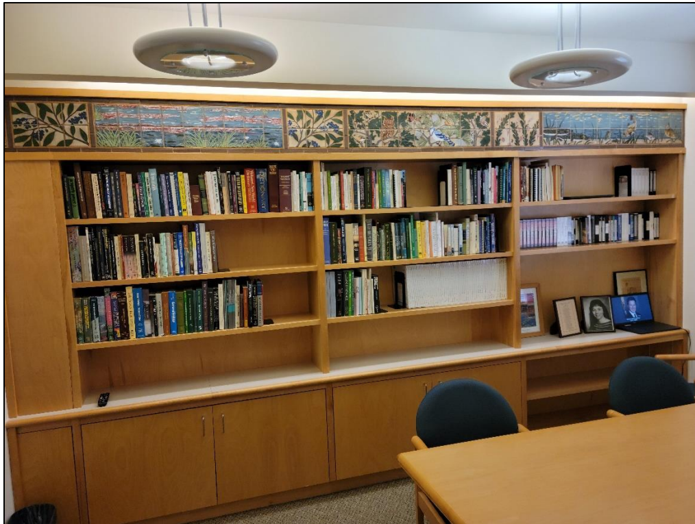
Books and Pinelands-themed tiles inside of the newly designated James J. Florio Pinelands Library at the Pinelands Commission's headquarters.