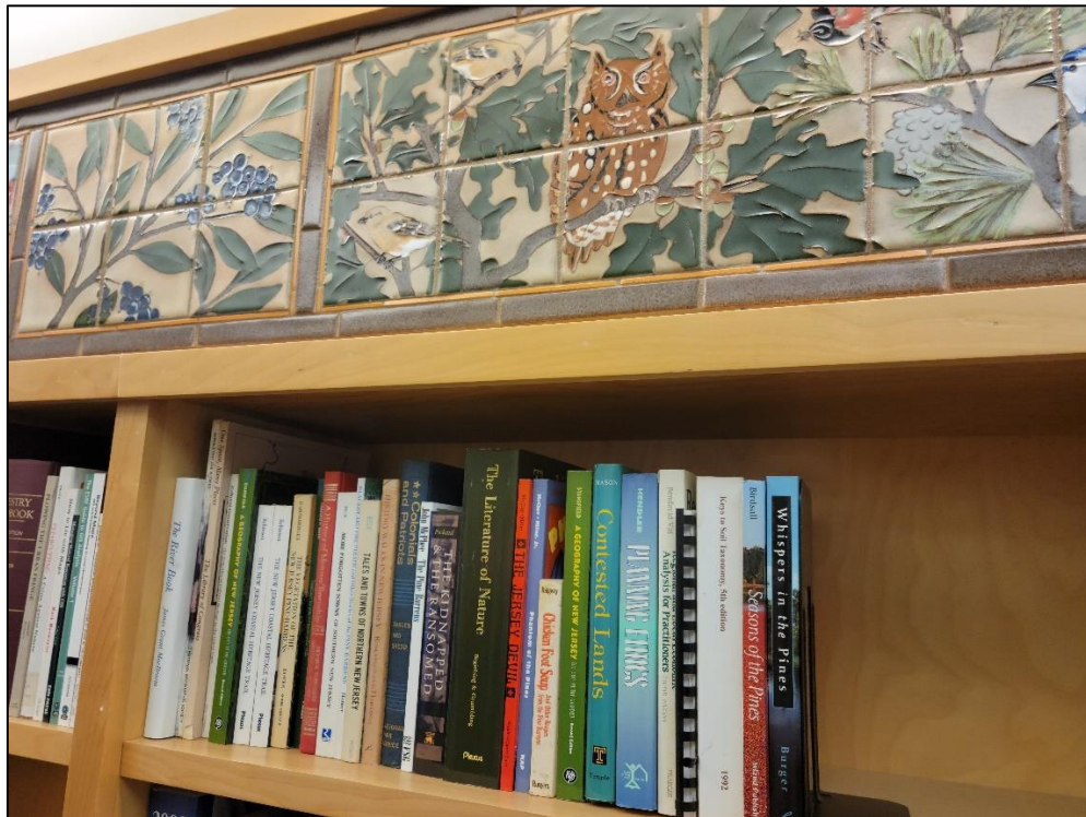
Books and Pinelands-themed tiles inside of the newly designated James J. Florio Pinelands Library at the Pinelands Commission’s headquarters.