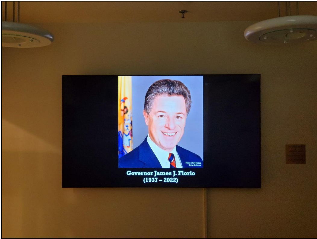
A television located inside of the Pinelands Library at the Pinelands Commission's headquarters.