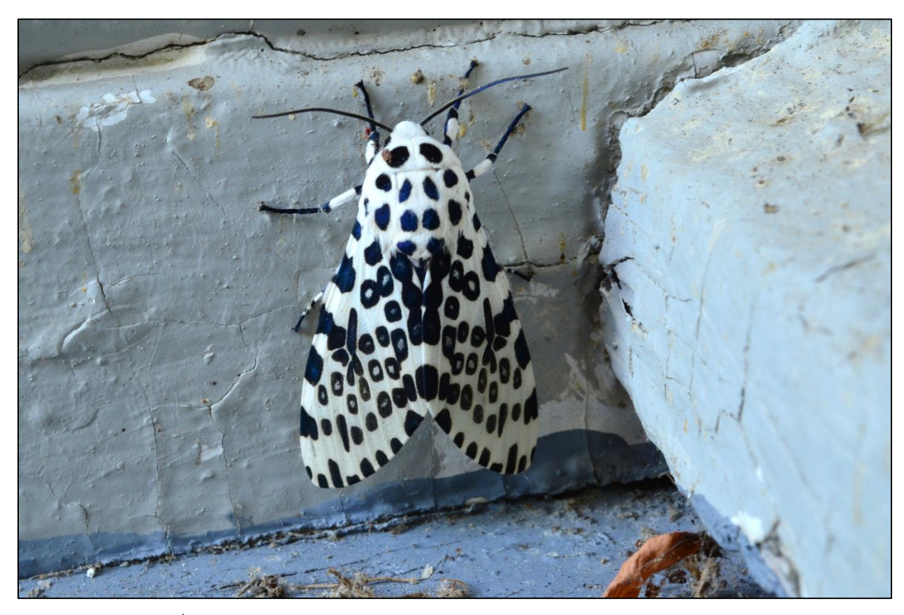
Above: The 34<sup>th</sup> annual Pinelands Short Course will feature 28 presentations, including one that will focus on moths. The photo above shows a giant leopard moth in the Pinelands. Photo/Paul Leakan

Above: The 34<sup>th</sup> annual Pinelands Short Course will feature 28 presentations, including one that will highlight the four seasons at the Edwin B. Forsythe National Wildlife Refuge. The photo above shows snow geese soaring above Wildlife Drive at Forsythe. Photo/Paul Leakan