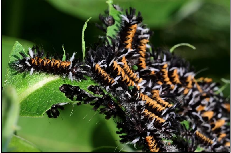
Above: Commission staff shared 67 tweets in August 2024, including this photo of milkweed tussock moth caterpillars feasting on common milkweed at the Commission's headquarters.