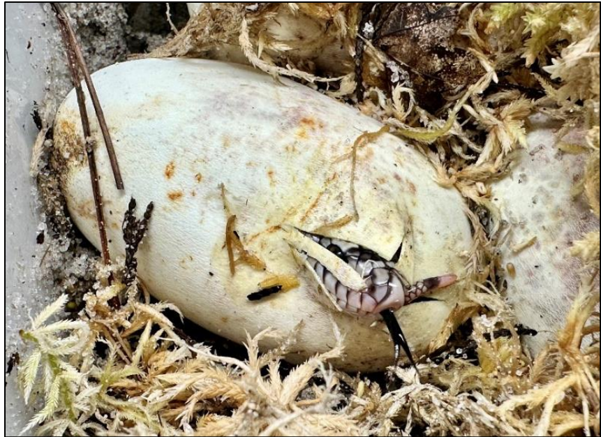
Above: This pine snake is about to become a hatchling. Eggs and hatchlings are also tested for the presence of snake fungal disease.