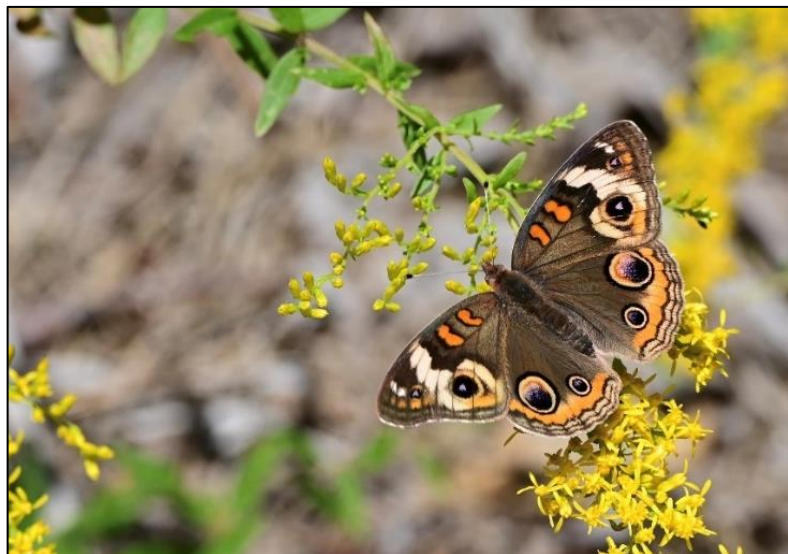
Above: Commission staff shared 221 photos on its Instagram account in August 2024, including this photo of a common buckeye butterfly sipping nectar from goldenrod flowers in the Pinelands.