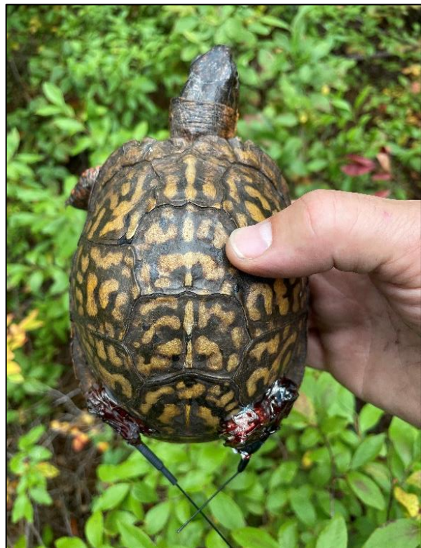
Above: A GPS logger programmed to collect location data four times a day is being tested on this box turtle. Transmitters must not exceed 3% of a turtle's body weight.