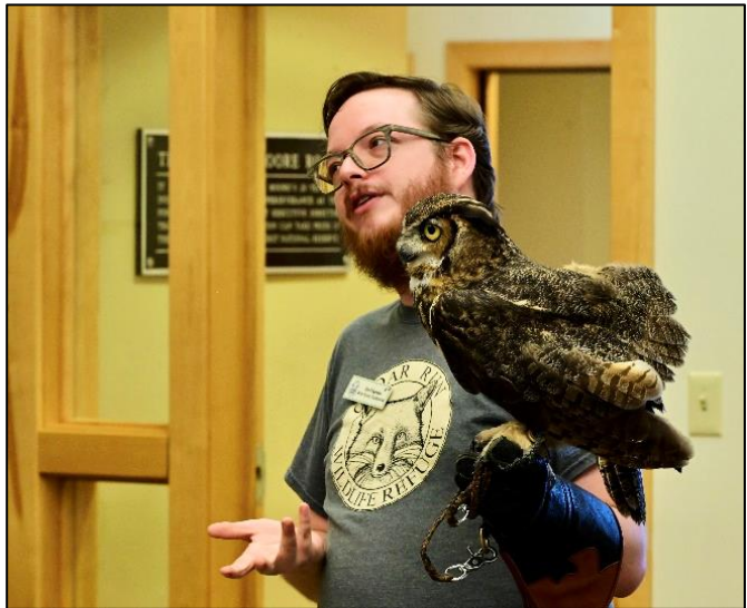
Above: Educators from the Woodford Cedar Run Wildlife Refuge brought live animals, including this great horned owl, to a presentation at the Commission's headquarters in August.