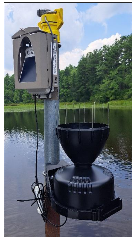
Above: A solar powered weather station was recently installed at a long-term monitoring pond.