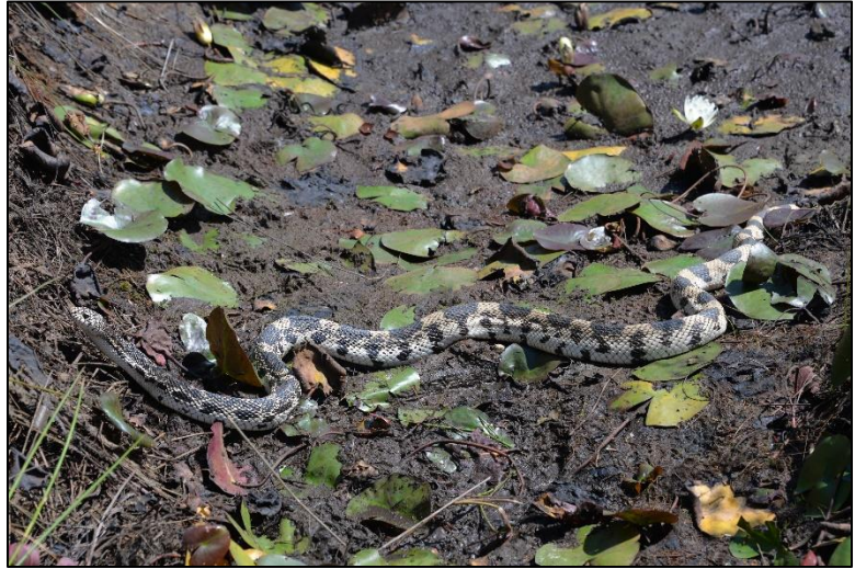
Above: A radio tracked pine snake traversing an abandoned cranberry bog.

snake hatchlings and 16 corn snake hatchlings from these clutches were weighed, measured, sexed, PIT tagged, and released at the nest location. Recapturing tagged hatchlings in the future can provide information on dispersal distances and survivorship. A total of four adult corn snakes, four pine snakes, and one black racer were also processed in August. Staff also surgically replaced, removed, or repaired transmitters, or implanted new transmitters into several corn snakes. Staff continued to fix and replace snake monitoring infrastructure that was damaged or destroyed by the Tea Time Hill wildfire. Staff also continue to maintain and service PIT tag readers at several pine snake hibernacula that have been studied for decades.