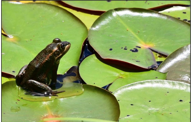
Above: Commission staff shared 217 photos on its Instagram account in July 2024, including this photo of a native carpenter frog sitting on a lily pad in a bog in the Pinelands.