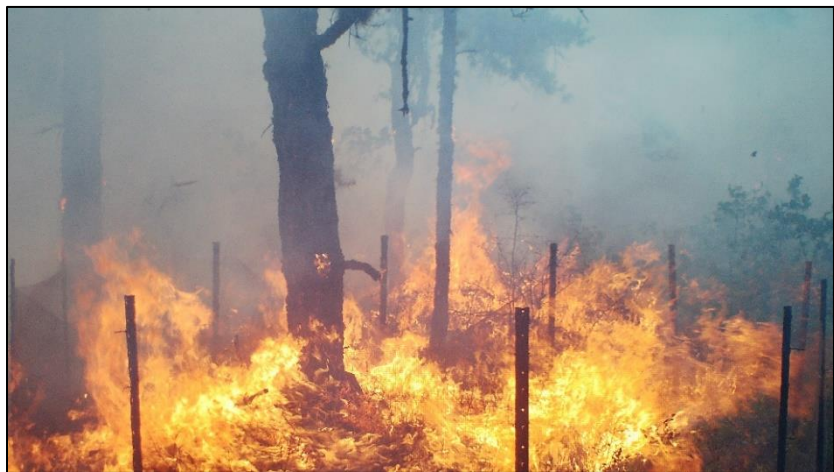
Above: This hibernation site corral was damaged in the Tea Time Hill wildfire.