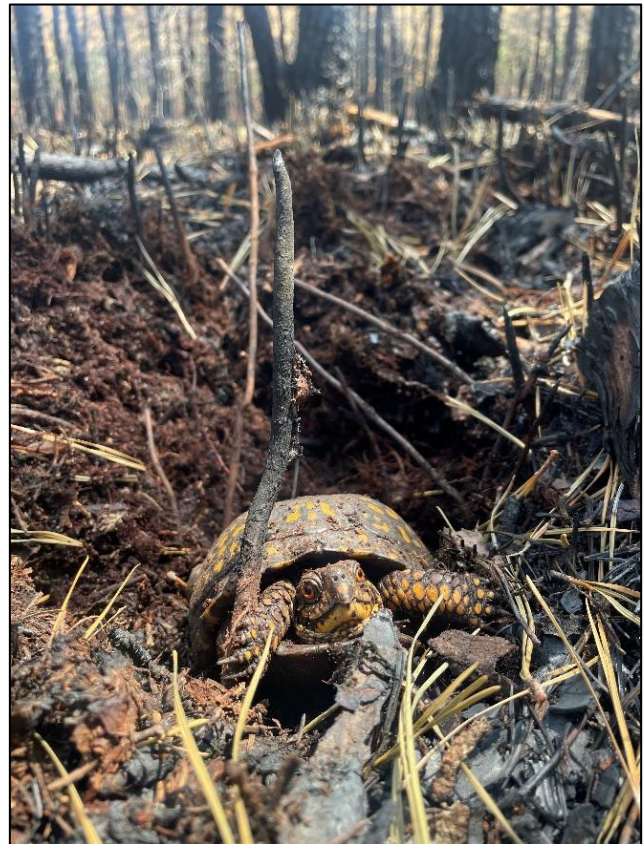
Above: Radio tracked box turtles in or near areas burned by the Tea Time Hill wildfire survived with no visible injuries.