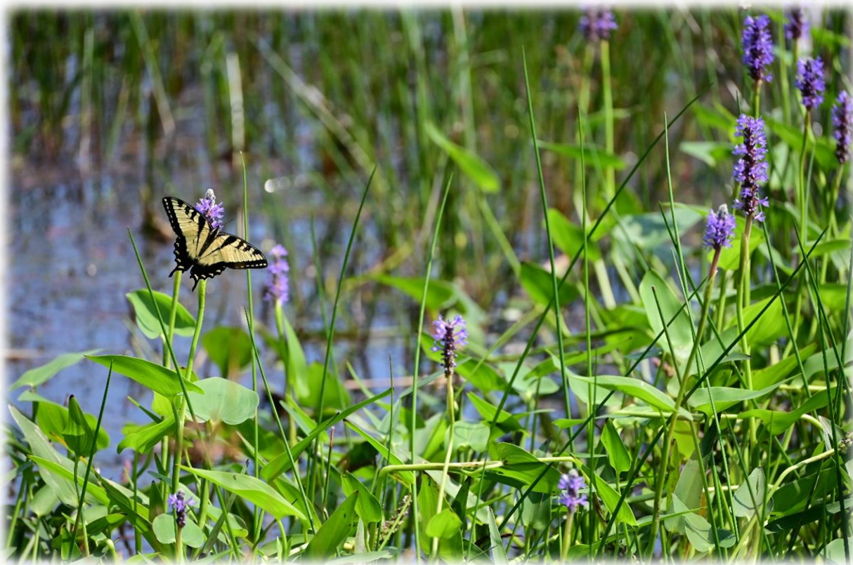
An eastern tiger swallowtail butterfly sipping nectar from native pickerelweed flowers in the Pinelands, as photographed in July