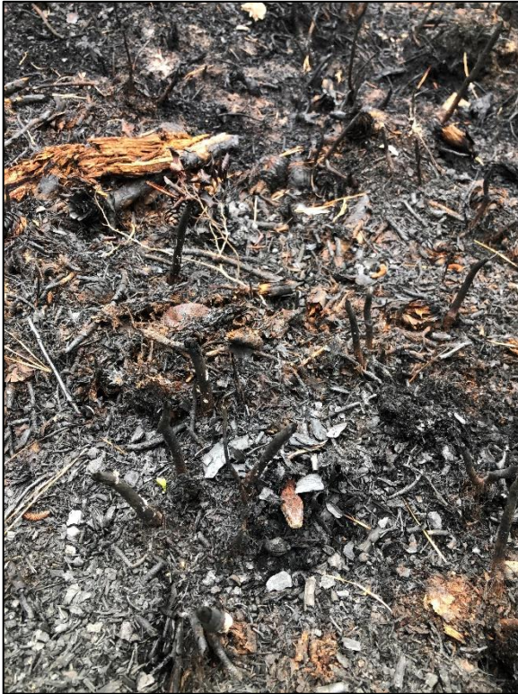
Above: A radio-tracked corn snake peers out from the duff layer to a charred landscape following the Tea Time Hill wildfire.

data at seven ponds and a forest plot that are equipped with continuous data loggers.