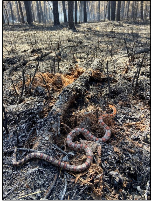
Above: Many hollow logs and other above-ground cover used by shedding corn snakes were consumed in the Tea Time Hill wildfire.