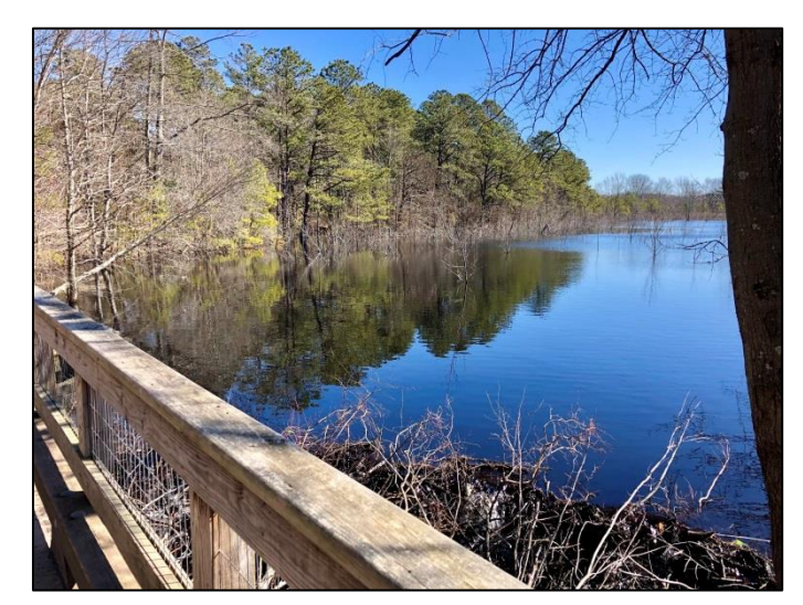
Above : Commission staff members shared 333 photos on the agency's social media sites in March 2021, including this photo of the Black Run Preserve in Evesham Township.

from February), the Instagram site has 1,356 followers (up 152 from February) and the YouTube Channel has 609 subscribers (up 46 from February).