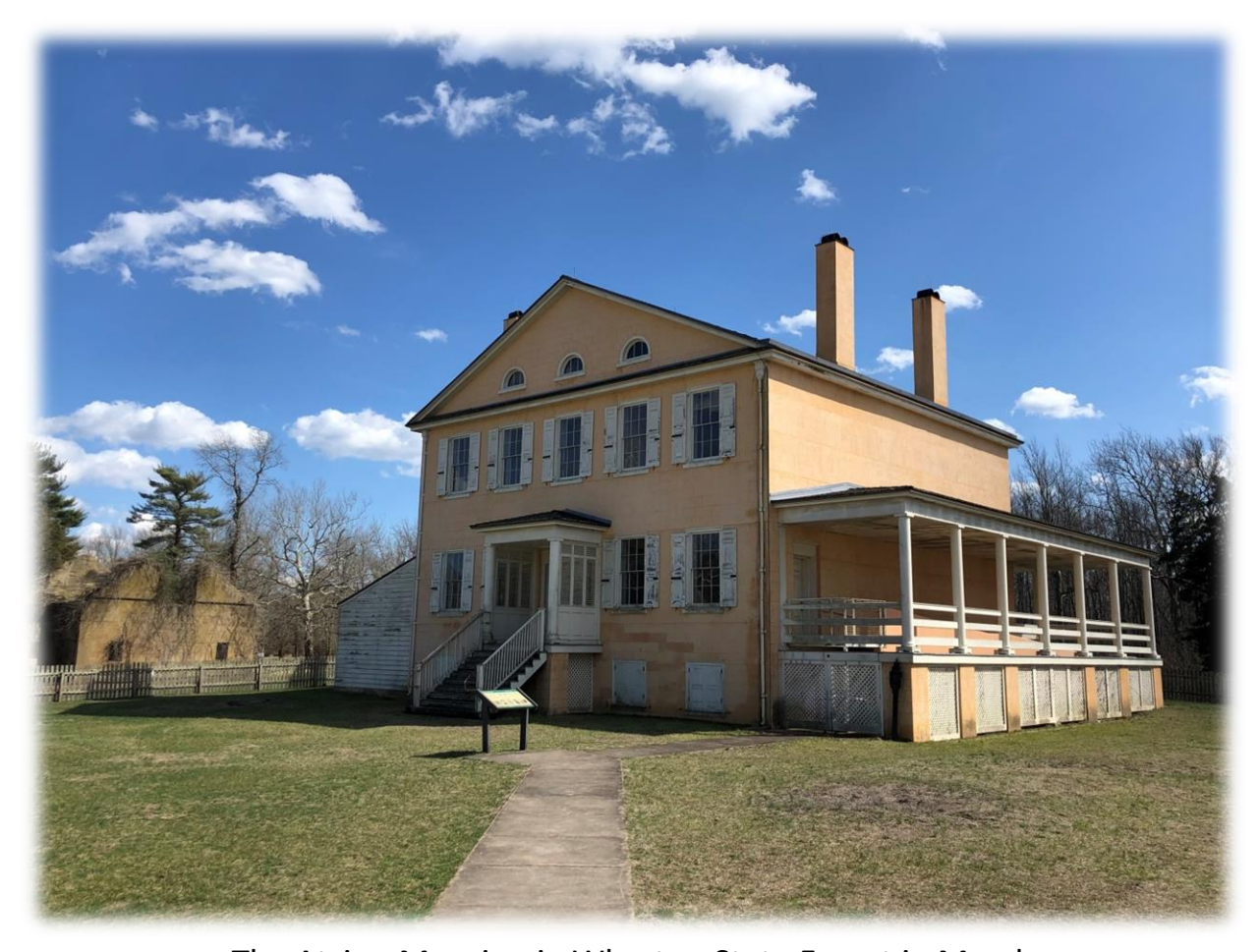
The Atsion Mansion in Wharton State Forest in March