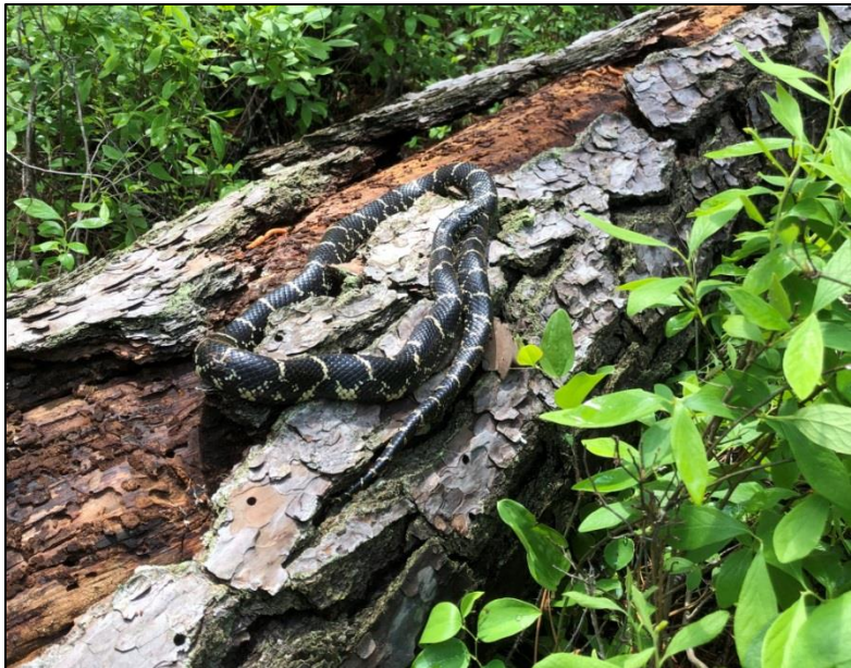
Above: Kingsnakes are often below the surface or partially hidden by the shrub leaf canopy, unlike this male basking on a rotten log.