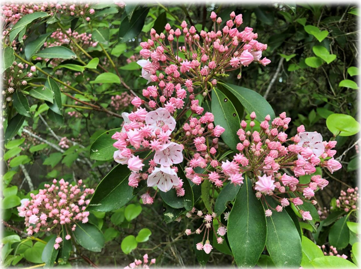
Mountain laurel in bloom