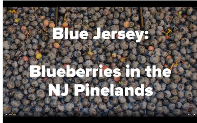
Above: In May 2020, staff created two new educational videos, including “Blue Jersey: Blueberries in the NJ Pinelands.”