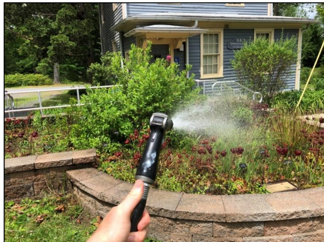
Above: Staff continues to maintain the Commission’s bog garden.