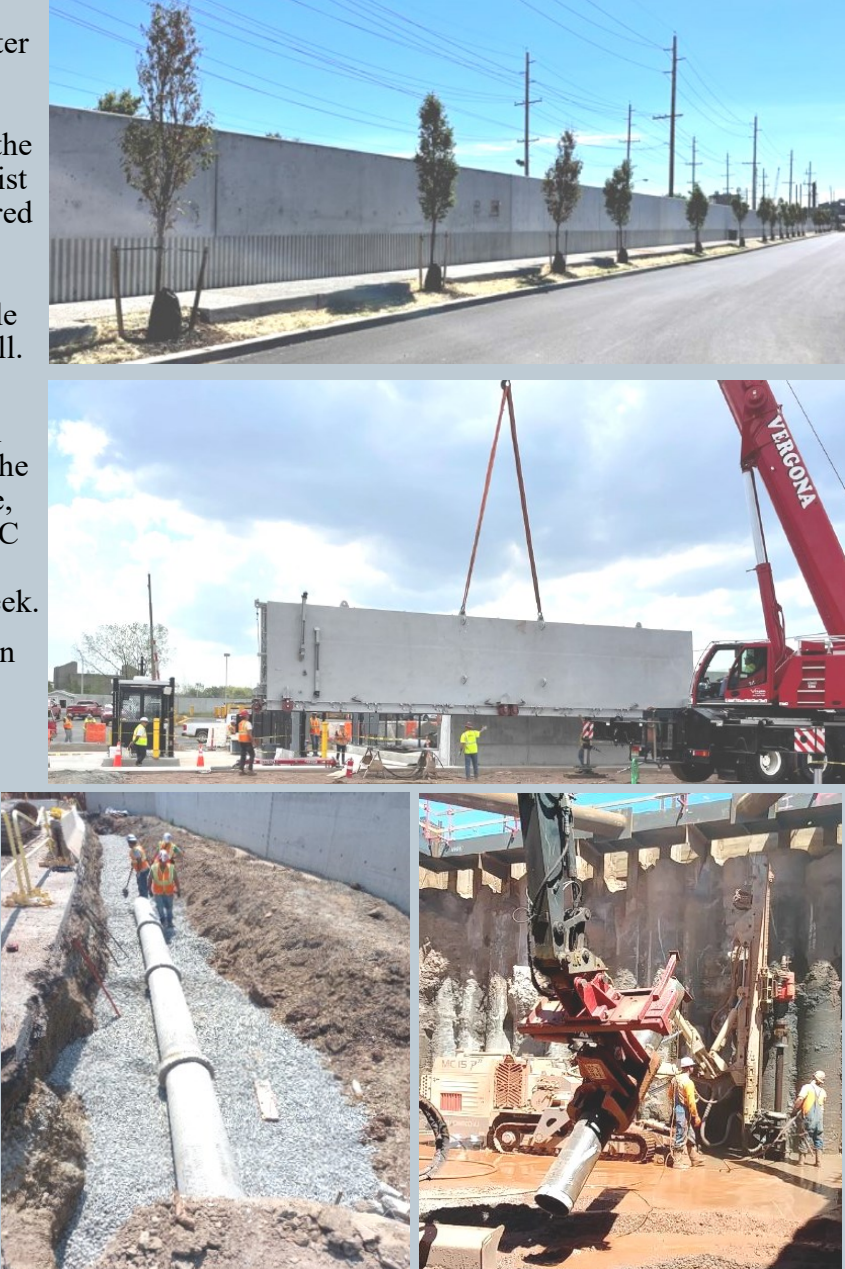
Images (clockwise from the top): The interior of the floodwall along Wilson Avenue; an automatic, heavy-duty gate being installed near the intersection of Avenue P and Rutherford Street; work being performed on one of PVSC's pump station wet-wells; drainage piping for PVSC's floodwater collection system being installed.

"The devastating effect that Hurricane Ian had on Florida is not lost on PVSC," said PVSC Executive Director Gregory Tramontozzi. "It served as a reminder of the need to be prepared for the problems that severe weather can bring. PVSC's recovery is just as much about building a