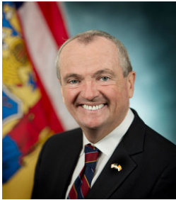
Phil Murphy Governor