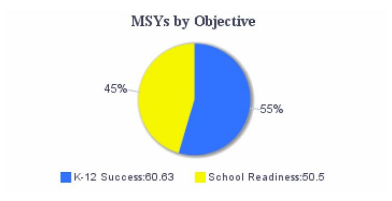
Table2: MSYs by Objectives

Table 2 and its corresponding pie chart show the same MSY information expressed as percentages of the total MSYs: