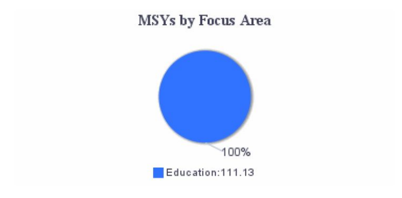
Table1: MSYs by Focus Areas

Table 1 and its corresponding pie chart show the total number of MSYs by Focus Area. Since both the K-12 Success and School Readiness objectives are in the Education Focus Area, Table 1 shows 100% of MSYs in Education.