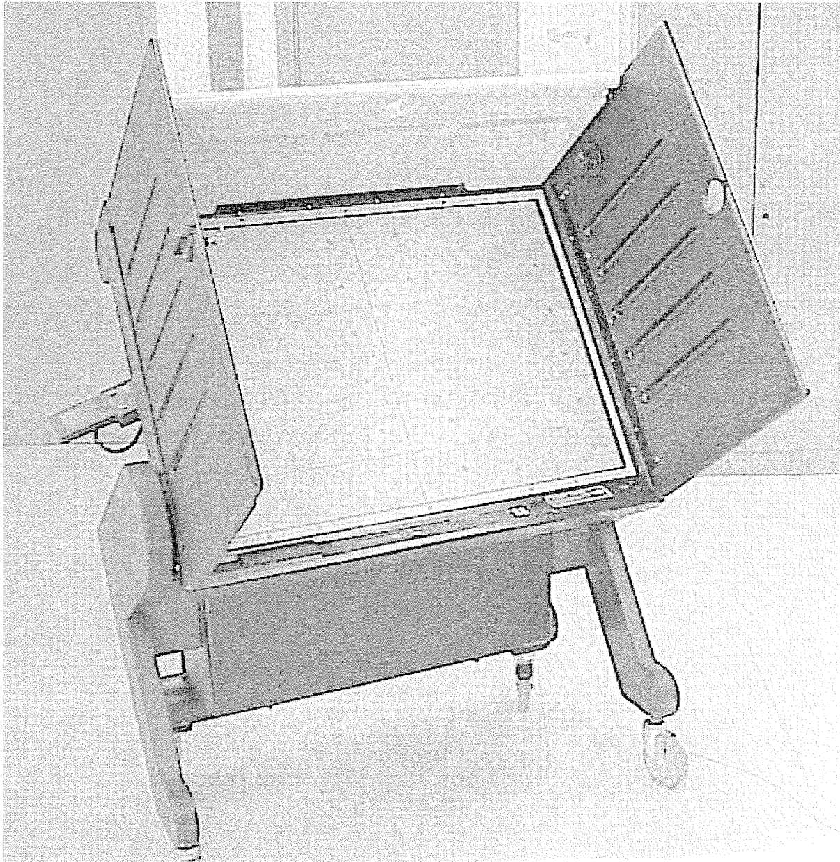
Photograph 1 AVC Advantage DRE