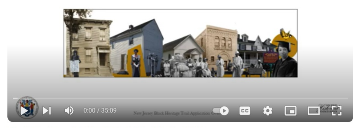
Black Heritage Trail Fall 2024 Application Video

To help members of the public prepare for the New Jersey Black Heritage Trail's Fall/Winter 2024 nomination cycle, the Black Heritage Trail team has recorded a step-by-step walkthrough of the nomination submission process and required documentation.