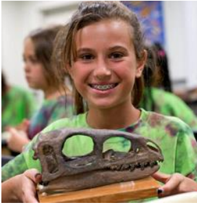
A KIT FOR THE FOSSIL LOVERS