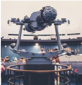
LIVE NIGHT SKY TALKS