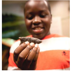
A KIT FOR THE CULTURALLY CURIOUS