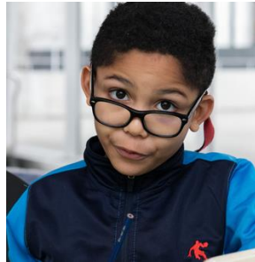
LIVE SCIENCE TALKS