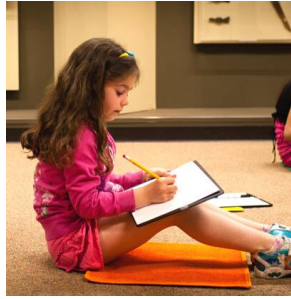
A KIT FOR THE ARTISTS