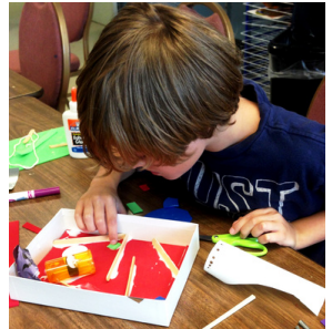
9 HOW TO ORDER