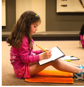
5 ART AND INSPIRATION KIT