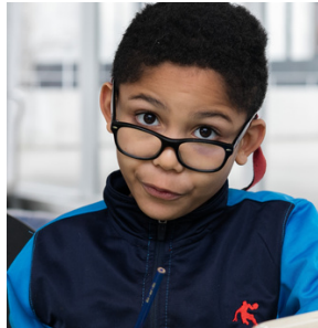
8 ASK THE EXPERTS LIVE SCIENCE TALKS