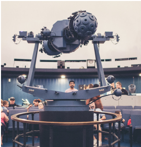
7 PLANETARIUM: LIVE NIGHT SKY TALKS