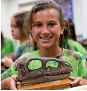
4 FANTASTIC FOSSILS KIT