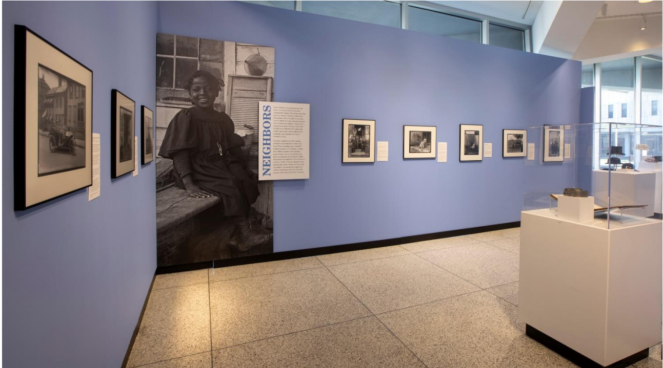
Discovering Grant Castner: The Lost Archive of a New Jersey Photographer exhibition

The Bureau of Cultural History preserves and interprets historical objects that document the lives of people who have lived in New Jersey from the 17th century to the present. The collection includes over 13,000 artifacts documenting New Jersey's cultural, economic, military, political and social history, as well as aspects of its decorative arts. Ranging from ceramics produced by Trenton potteries to decorative quilts made by New Jersey women to utilitarian artifacts reflecting a rich maritime and agricultural heritage, the Cultural History Collection is one of the largest material culture collections dealing with New Jersey history. Textiles, trade tools, furniture and an array of artifacts documenting craft, work, play, community and family life are also represented in the collection. The collection reflects recent New Jersey history with its significant holdings of artifacts documenting the September 11, 2001 terrorist attack and its impact on the people of New Jersey. The Cultural History Bureau also oversees the preservation and interpretation of the New Jersey State Capitol's collection of rare military flags used by New Jersey regiments in the Civil War.