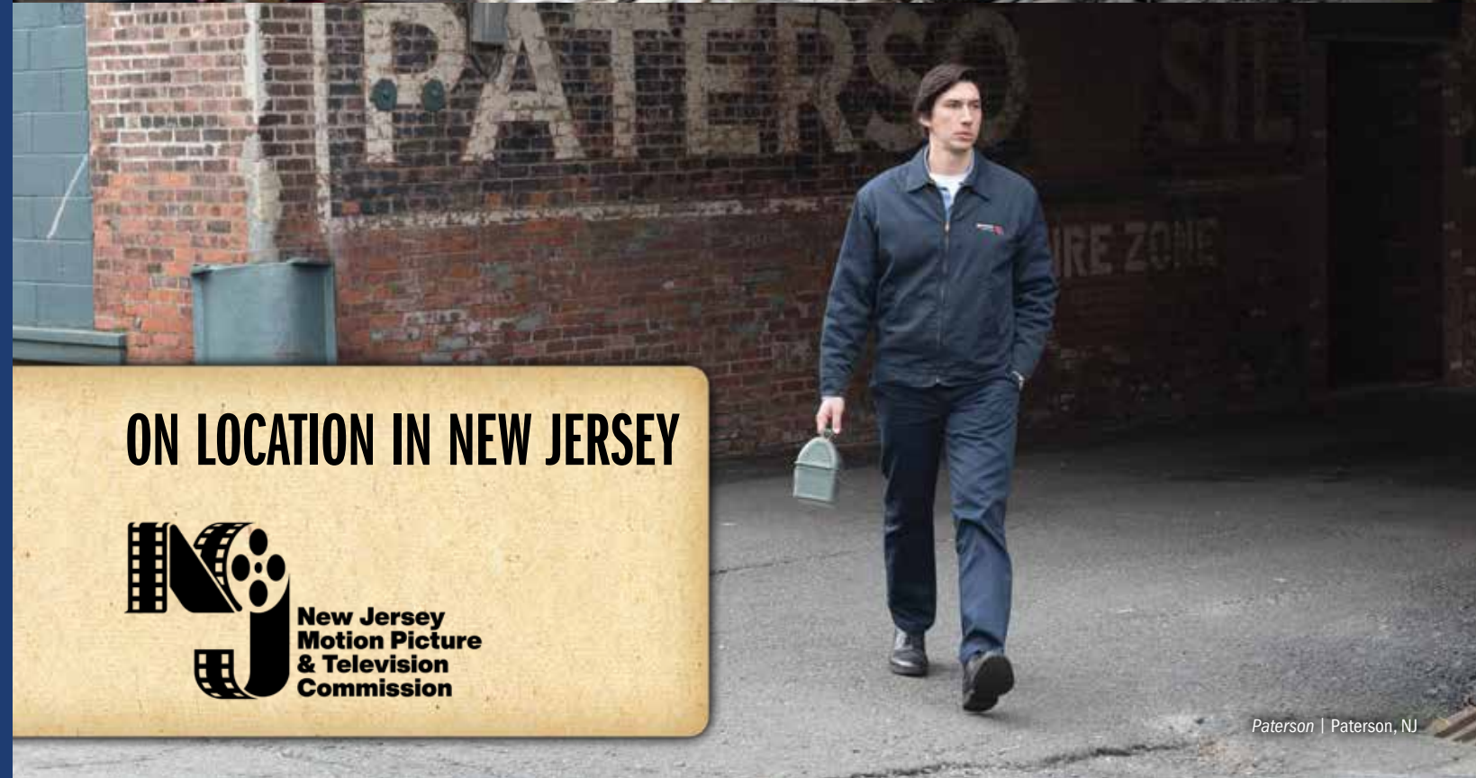
Paterson | Paterson, NJ