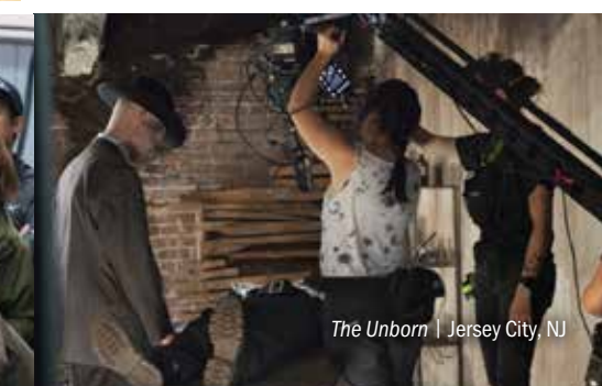
The Unborn | Jersey City, NJ