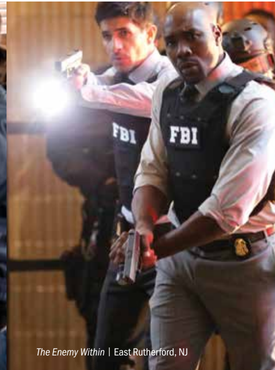
The Enemy Within | East Rutherford, NJ