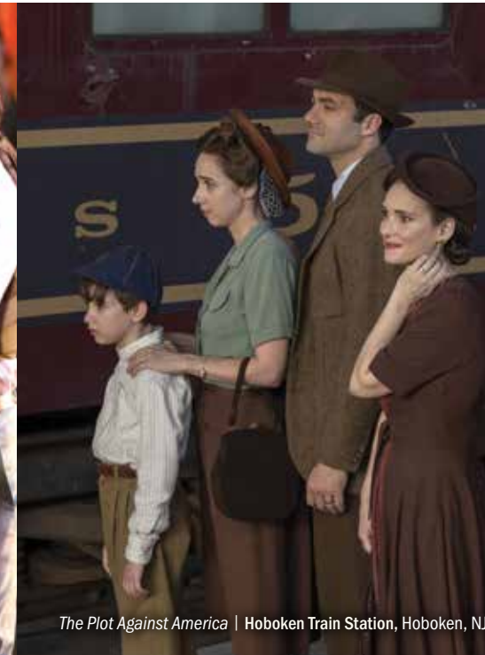
The Plot Against America | Hoboken Train Station, Hoboken, NJ