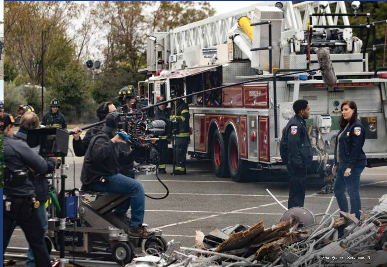
Emergence | Secaucus, NJ