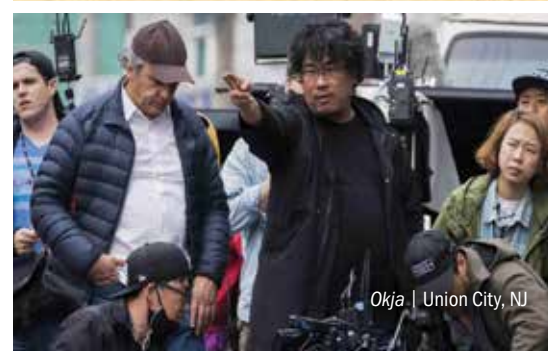
Okja | Union City, NJ