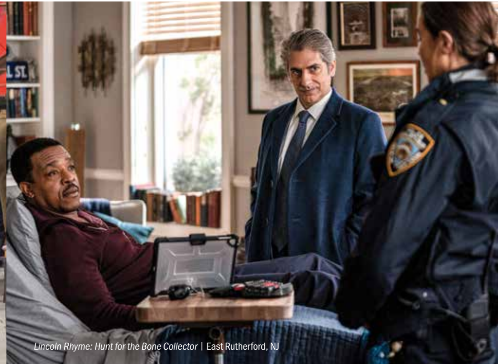
Lincoln Rhyme: Hunt for the Bone Collector | East Rutherford, NJ