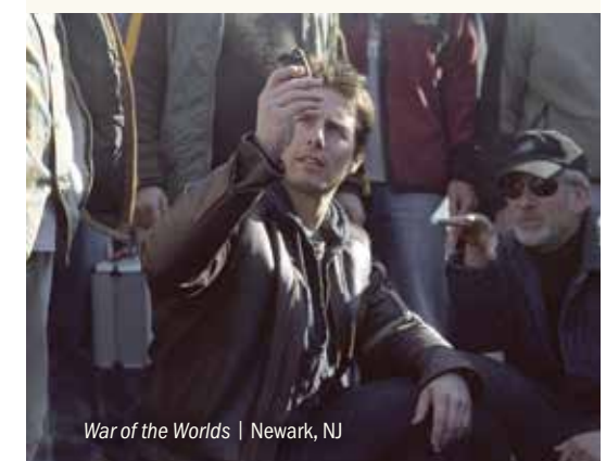
War of the Worlds | Newark, NJ

The Motion Picture and Television Commission offers an internship program that is open to all New Jersey residents currently matriculating in college and graduate schools. The internship affords students the opportunity to work with Commission staff members, learn about the pre-production and production phases of filmmaking, and visit the sets of film projects being shot in the State. Visit www.film.nj.gov for more information.