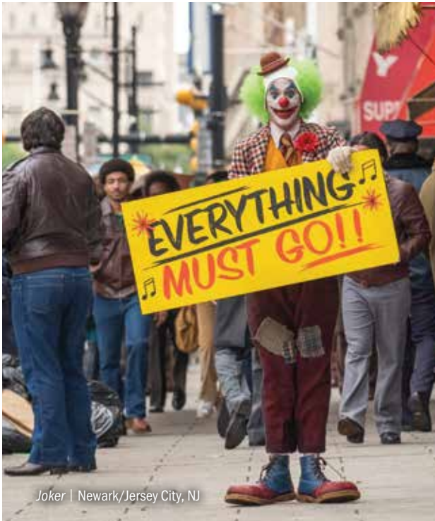
Joker | Newark/Jersey City, NJ