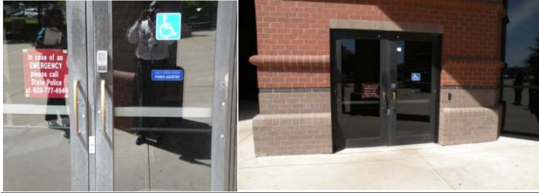
AFTER: Signs installed 5/21/10 directing visitors to the E&O building for access to buildings.