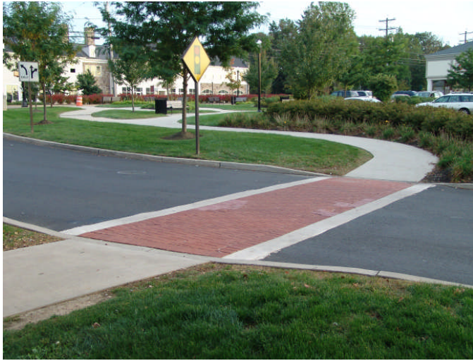
Parking lots can be designed to minimize conflicts between pedestrians and drivers.

Surface parking facilities can be designed to be environmentally friendly by including stormwater treatment features for runoff. Bioretention is an efficient method that uses natural materials to remove pollutants from runoff. Placing bioretention areas—consisting of sand and soil mixed with native plants—adjacent to impervious surfaces, including parking areas and internal access ways, helps filter runoff and improve drainage. Alternatively, permeable pavement can be used to reduce runoff. Materials such as porous asphalt pavement and permeable pavers allow water to soak through into the soil below. These options provide sustainable solutions for managing parking.