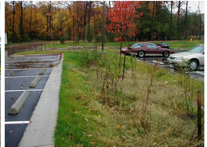
Permeable interlocking pavers and biofiltration swales can reduce environmental impacts.