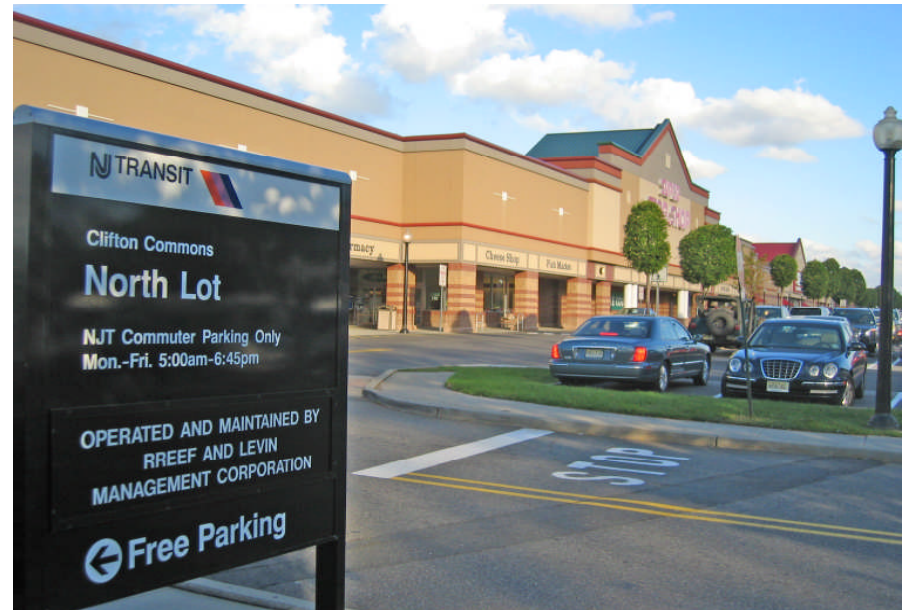
Shared parking at a Clifton shopping center accommodates transit users on weekdays.

Regulations governing the duration and price of municipal parking should take into account the desired parking turnover for each parking district. Should a given lot or set of on-street meters accommodate leisurely shopping and dining, all-day shopping by transit users or area employees, or quick errands only? A combination of time limits, while potentially confusing, may help ensure that spaces regularly become available for those using a drug store or Post Office, while other spaces can be occupied by longer term visitors.