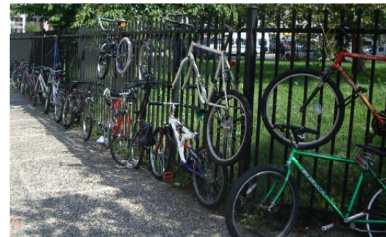
Bicycles should be inside a fenced area, not on a fenced area!