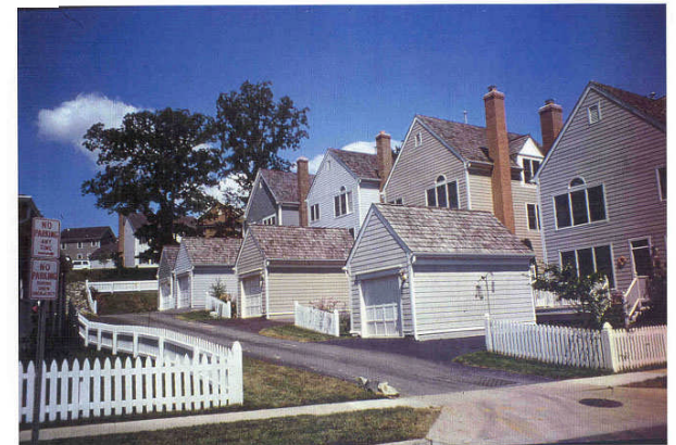
If garages face onto an alley, front porches can face the street.

The design of residential parking can also affect community life in subtle ways. Attached garages, the norm in suburban developments, provide convenience but can reduce opportunities for interaction with neighbors, if people come and go solely in their cars. House designs that place garages nearest the street and obscure the front doors can give a neighborhood an inhospitable quality. Conversely, designs that reduce the prominence of garages may make a street more welcoming to pedestrians and encourage social interaction.