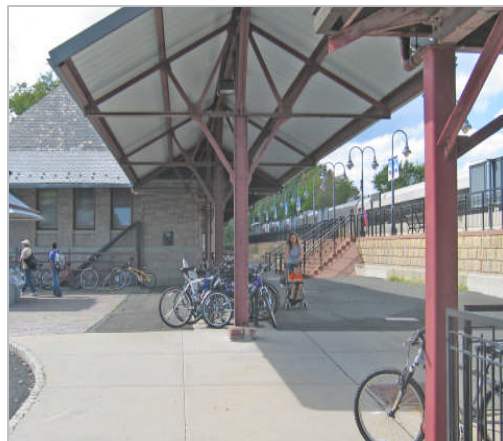
Sheltered bicycle parking at Westfield Station.