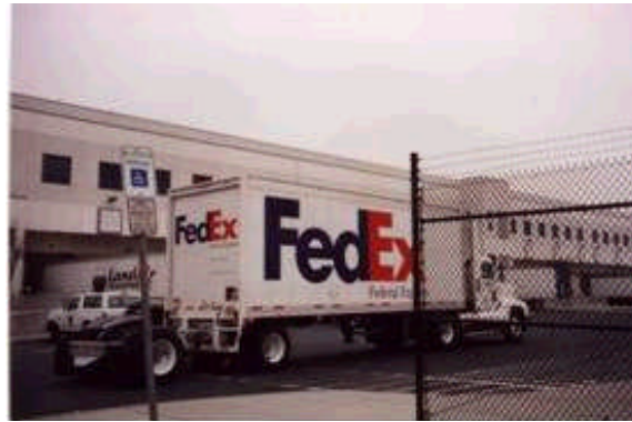
Planning for truck access and loading zones can improve local traffic flow.

While truck traffic is often a concern to municipalities, goods movement is an essential part of both regional and local economies. Consideration should be given to the need for designated loading areas for deliveries. Loading zones should be accessible from primary truck routes, close to the delivery destinations they serve and well marked. Shared loading areas should be considered. Zones may be regulated at all times, or for certain days or hours only, so that other vehicles may use the space at non-delivery times.