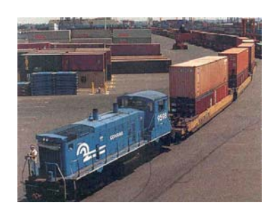
Line-Haul Rail Service