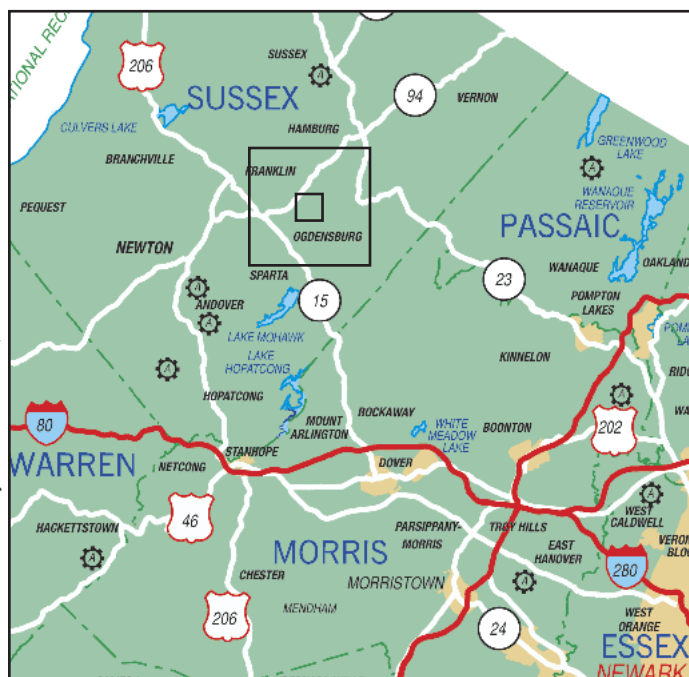
Project vicinity map

Additional information on transportation projects and historic preservation is available from the Division of Environmental Resources, New Jersey Department of Transportation ( http://www.state.nj.us/transportation/works/environment/overview.htm ), the Federal Highway Administration ( http://www.fhwa.dot.gov/environment/archaeology/index.htm ), the New Jersey Historic Preservation Office ( http://www.state.nj.us/dep/hpo/2protection/njreview.htm ), and the Advisory Council on Historic Preservation ( http://www.achp.gov/work106.html ).