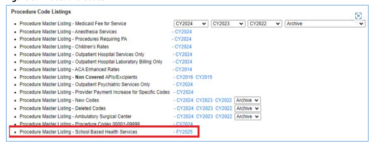
Figure 3: Procedure Codes