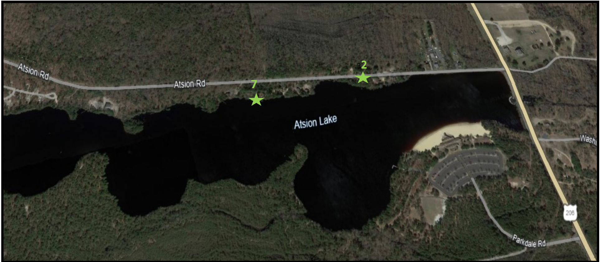
Project Site Map Wharton State Forest EXHIBIT 'B'