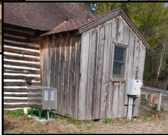
Well water supply