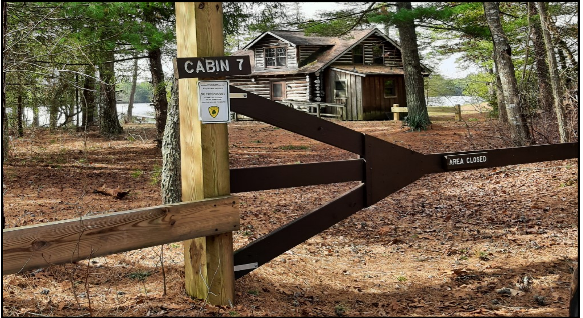
Cabin # 7