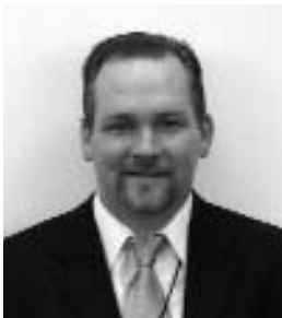
JEFFREY IGNATOWITZ Deputy Attorney General