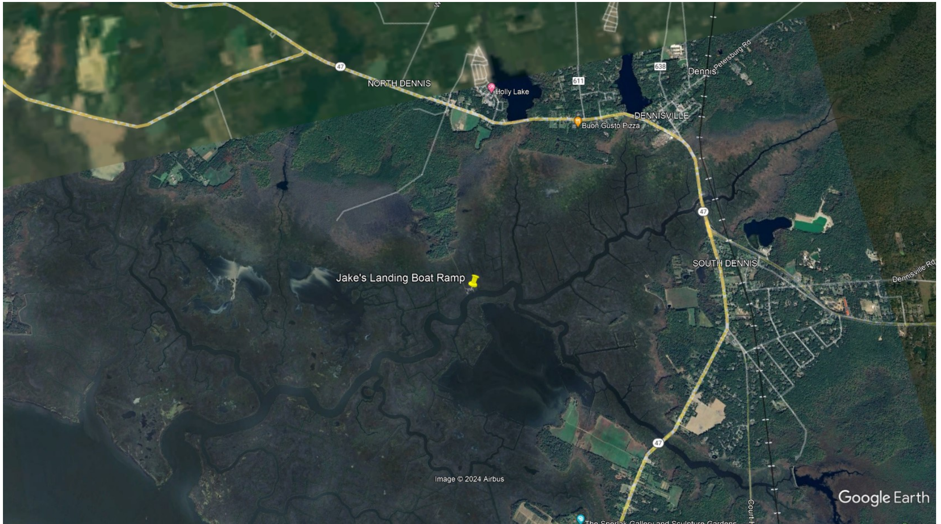
Project Site Location Map Jake's Landing Boat Ramp EXHIBIT 'B'