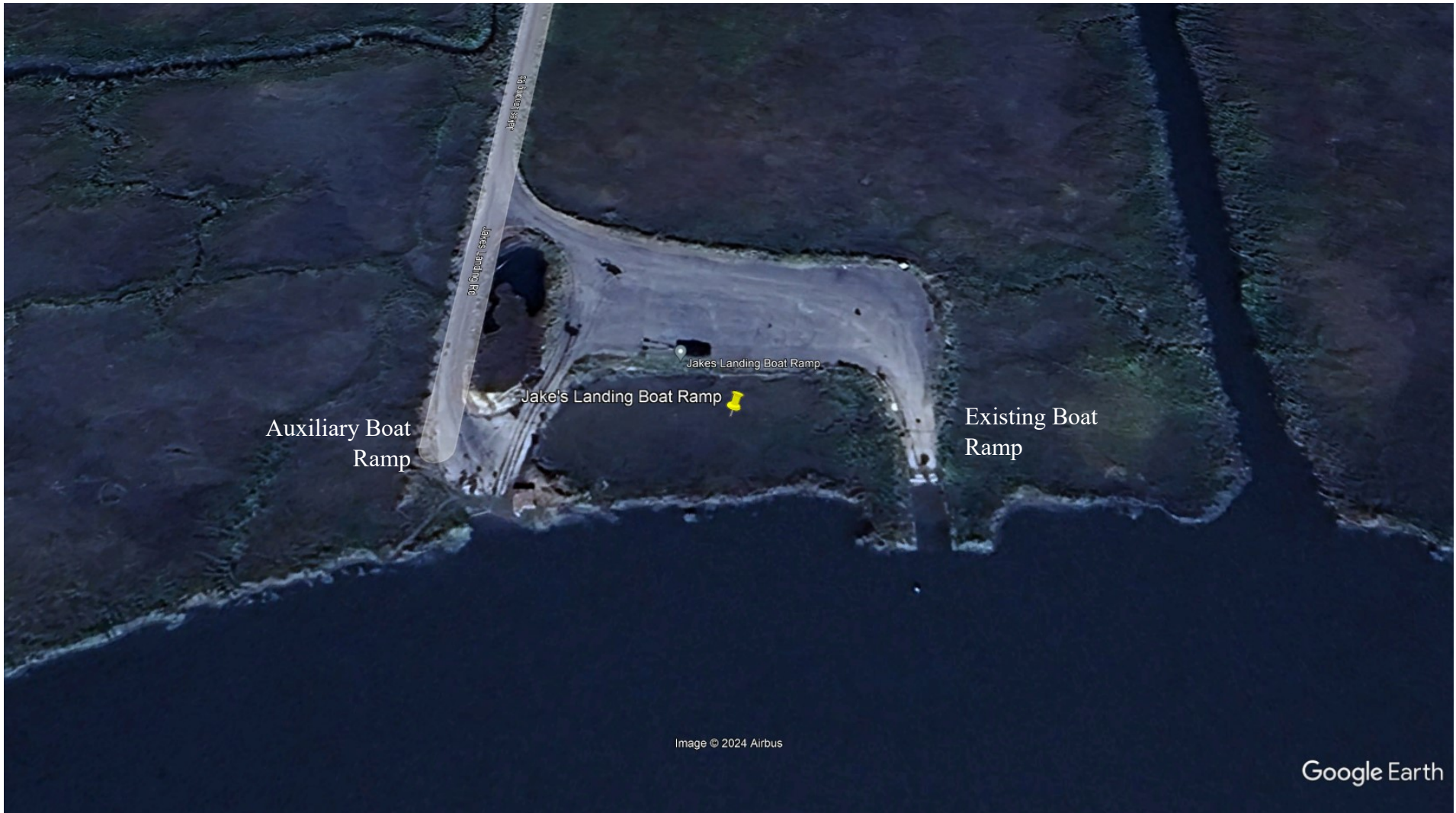
Aerial View of Project Site Jake's Landing Boat Ramp EXHIBIT 'C'