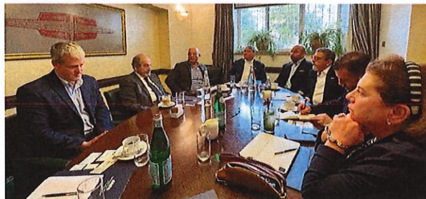
Meeting with the Palestinian American Chamber of Commerce in Jerusalem with Choose New Jersey and the U.S. Office of Palestinian Affairs