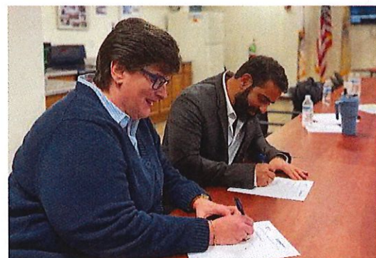
Signing of the Ashdod – Newark Sister Port Agreement