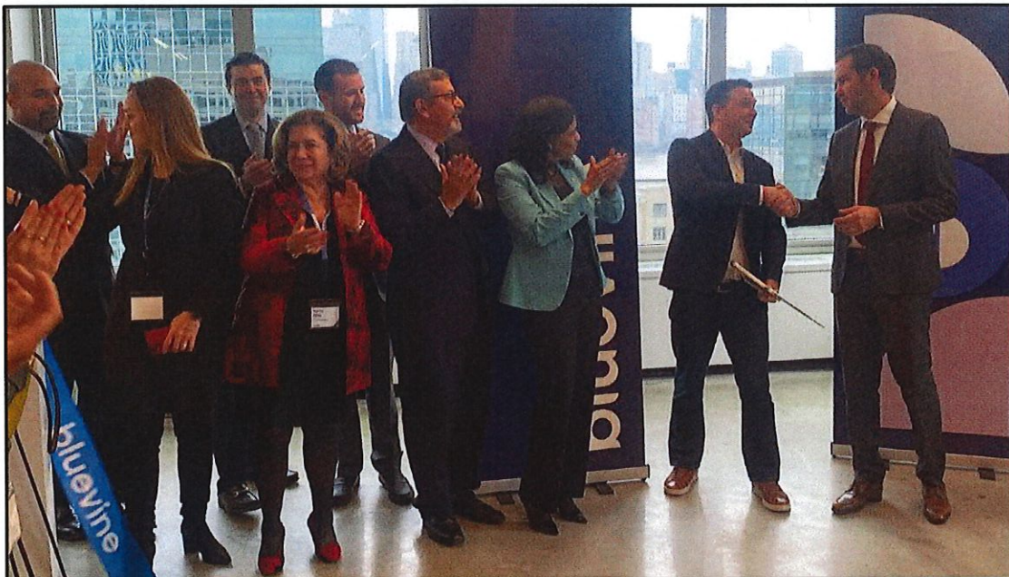
Opening of the new U.S. headquarters of Bluevine, an Israeli financial services company in Jersey City