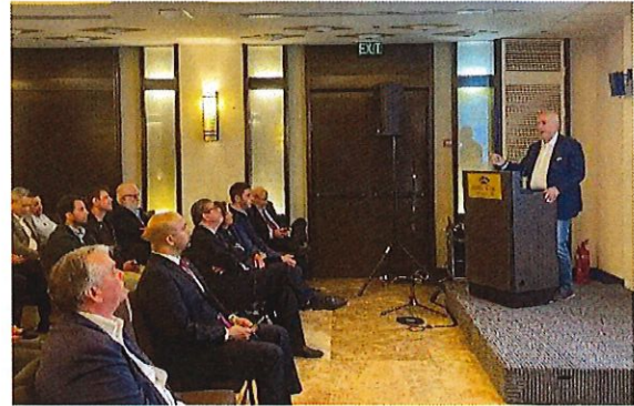
Launch of the Choose New Jersey Israel Center with Peres Center Chairman Chemi Peres