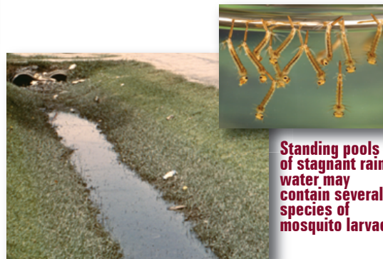
Standing pools of stagnant rain water may contain several species of mosquito larvae.

To get the phone number for your local mosquito control agency, call 1-888-NO NJ WNV and follow the prompts to enter your area code.